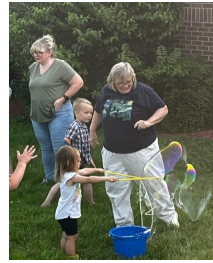
B u b b l e s